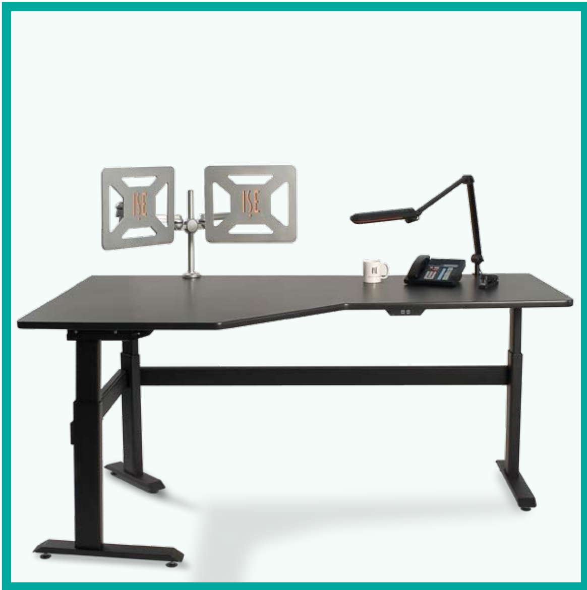
ELECTRIC E5 DESK 3-PARALLEL 25"- 44"