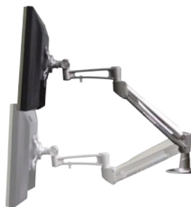
Raise and lower