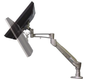
Tilt and swivel